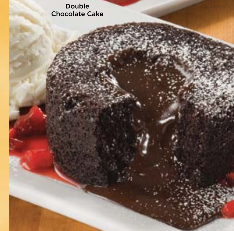
Double Chocolate Cake