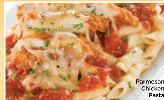
Parmesan Chicken Pasta