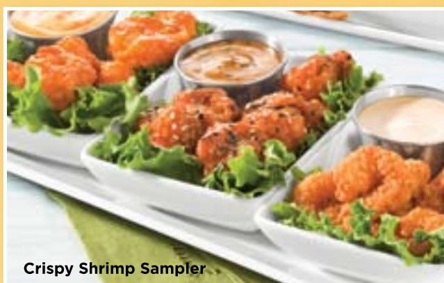
Crispy Shrimp Sampler

NEW Wing Sampler Tender, full-of-flavor chicken wings done three ways: Barbecue, Buffalo style, and our sesame-peanut glaze. 45 DHS