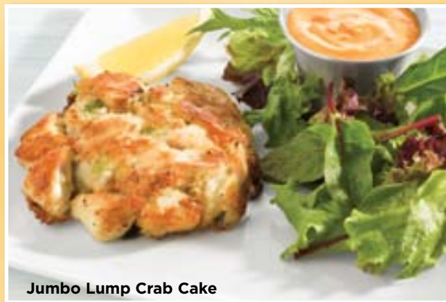
Jumbo Lump Crab Cake