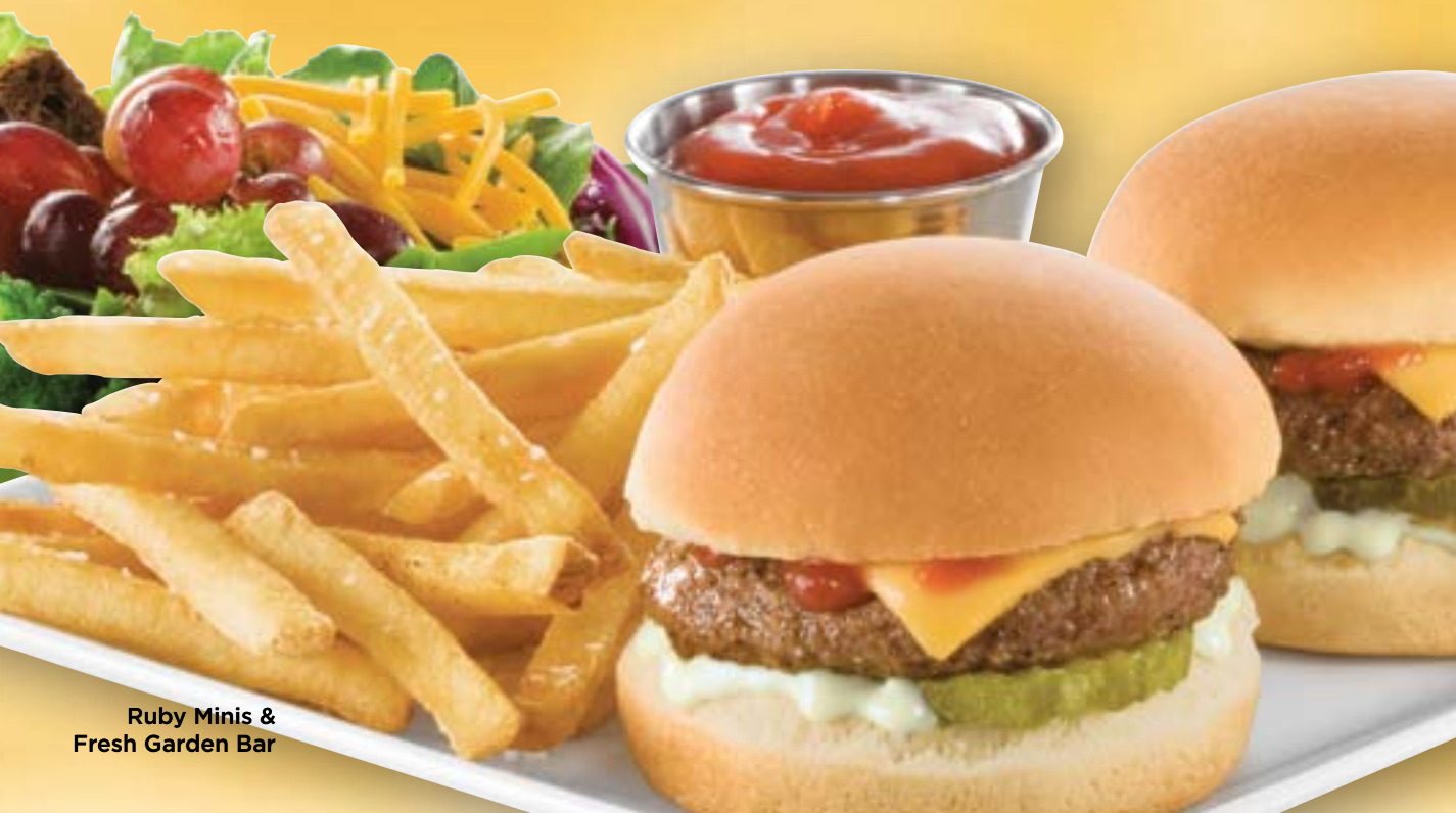
Ruby Minis & Fresh Garden Bar

NEW Crab Cake Minis Topped with fresh leaf lettuce, tomato, and sweet, spicy chile sauce. with soup 50 DHS • with salad 54 DHS