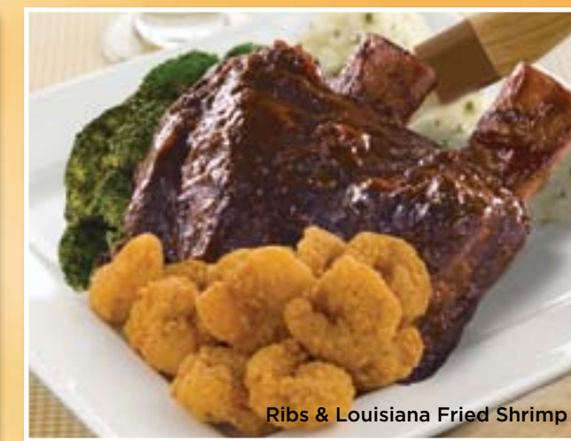
Ribs & Louisiana Fried Shrimp