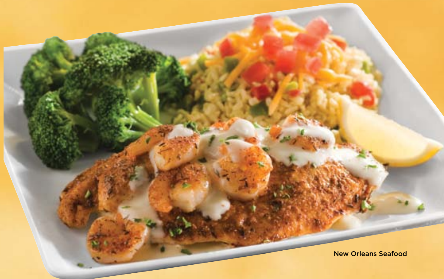
New Orleans Seafood

Lemon Grilled Salmon Grilled salmon with a delicate lemon-butter sauce. Served with brown-rice pilaf topped with cheese and tomatoes and your choice of fresh chef's vegetables or steamed broccoli. 72 DHS