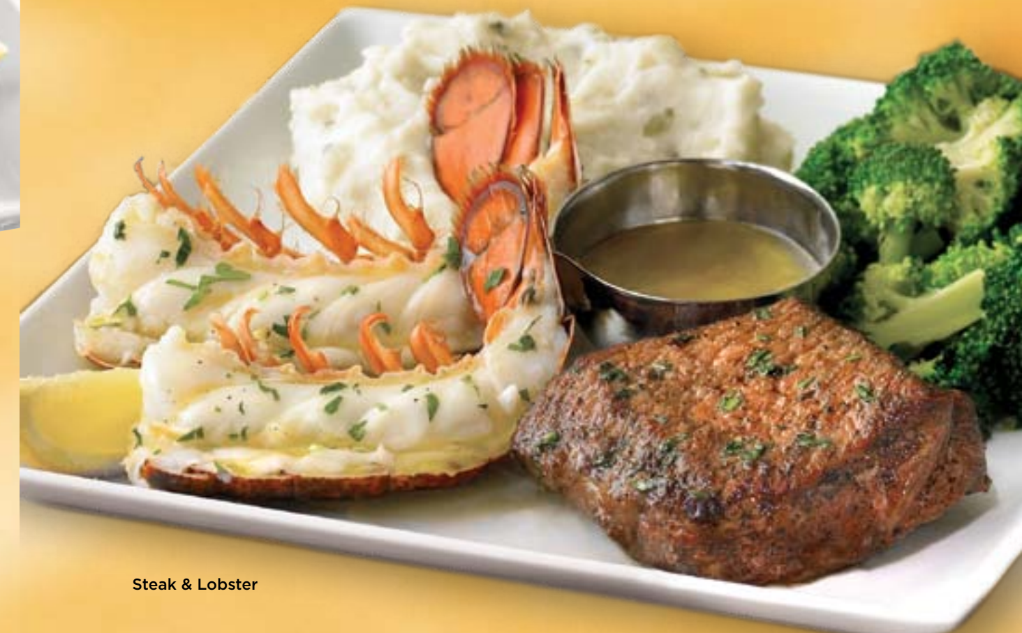
Steak & Lobster

Ribs & Steak* A petite sirloin and a half-rack of barbecue USDA ribs with crisp onion straws. 105 DHS