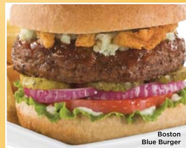
Boston Blue Burger

Chicken Burger Premium ground chicken with savory seasonings it's juicy and full of flavor. 39 DHS