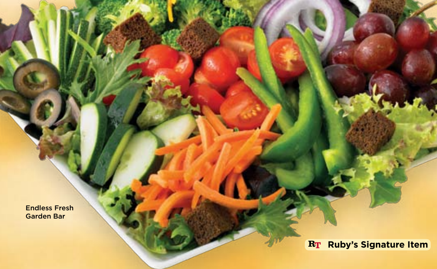
Endless Fresh Garden Bar