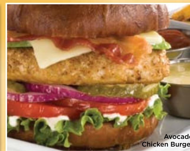
Avocado Chicken Burger