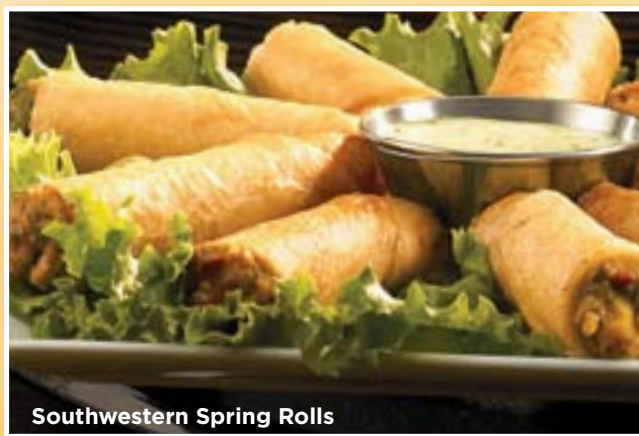
Southwestern Spring Rolls