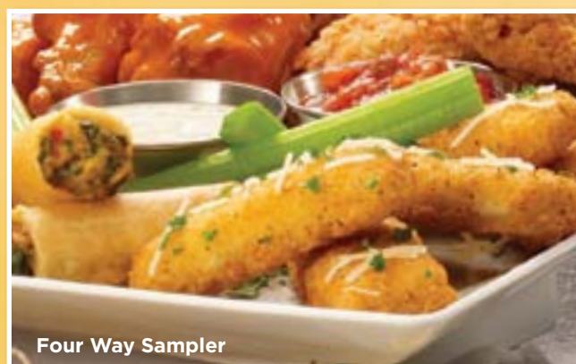
Four Way Sampler